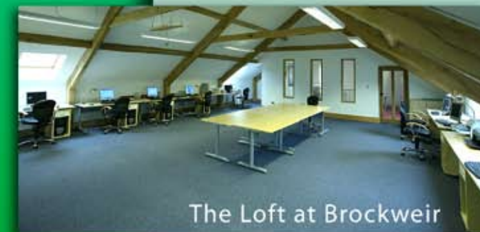
The Loft at Brockweir